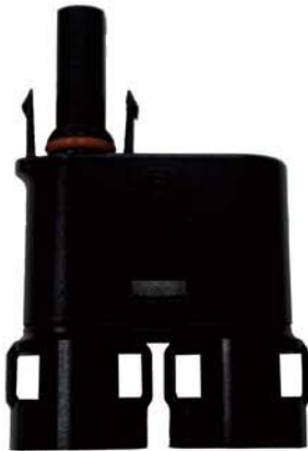
两母一公 2 Female to 1 Male BC40-2F1M